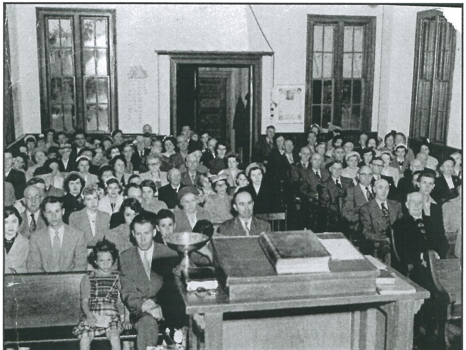
Inside St. Andrew's in 1956 when the congregation was fundraising for a new building. It may have been taken to show how crowded the building had become.