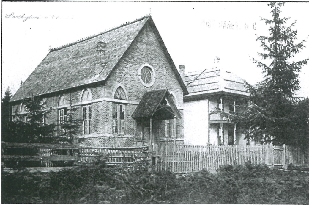
St. Andrew's Presbyterian Church in 1906. Photo taken just as the manse (right) was being completed. MRM&A P07547

brick cladding is another character-defining element in the Statement of Significance, which was an unusual material to use in the construction of a church at this early time in BC. The use of the brick in St. Andrew's Church continues to serve as a reminder of Maple Ridge's early industrial roots and charitable community spirit.