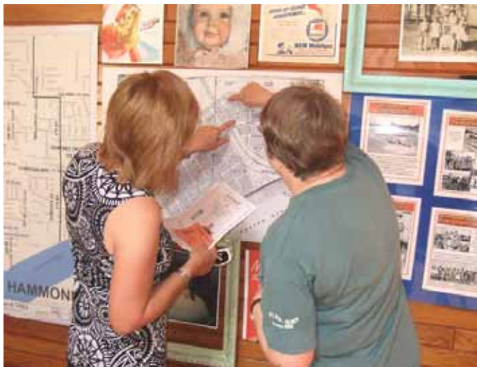
Studying the old maps. Here is where I live!