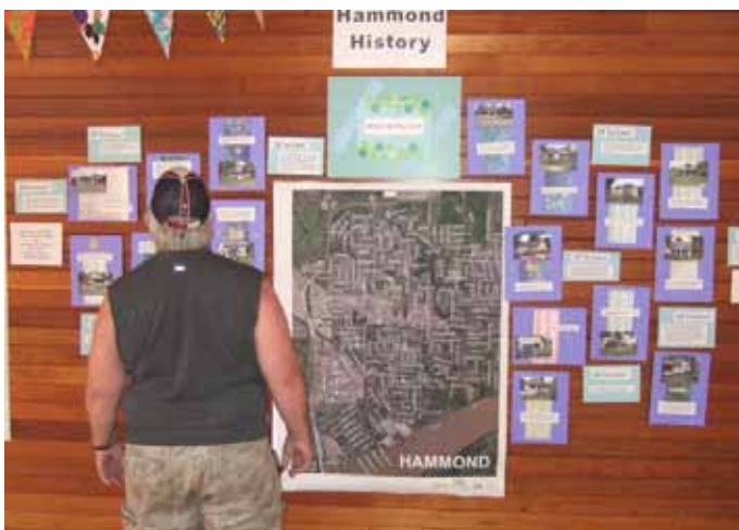
An unidentified student of Port Hammond’s history.