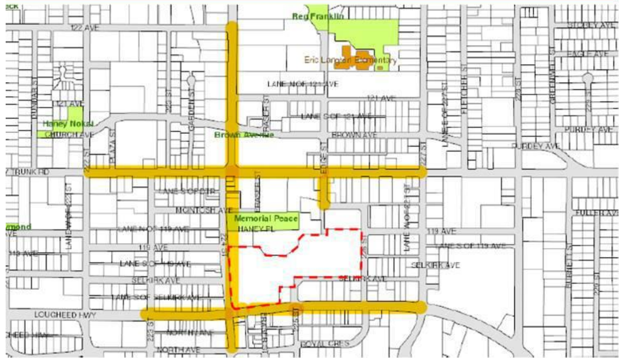
Suggested streets (high-lighted in yellow) where cycling on the sidewalk should no longer allowed.