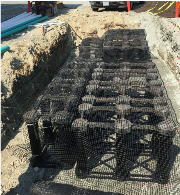
Silva cell under construction on 225th Street.

The objectives of the Downtown Enhancement Projects include increasing the livability of the Town Centre, supporting business growth and encouraging future investment in the area, while enhancing the street experience for pedestrians and shoppers and the safety of road users.