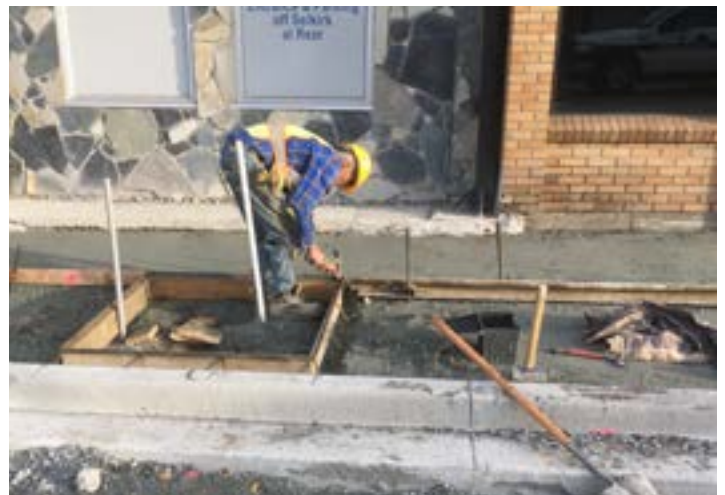
Placing tree grate forms in preparation for pouring exposed aggregate stretch on the north side of Lougheed Highway.