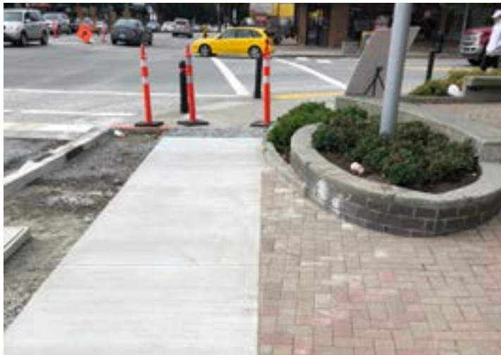
Reinstatement of one of the brick pathway connections along Lougheed Highway near Westminster Savings Credit Union.