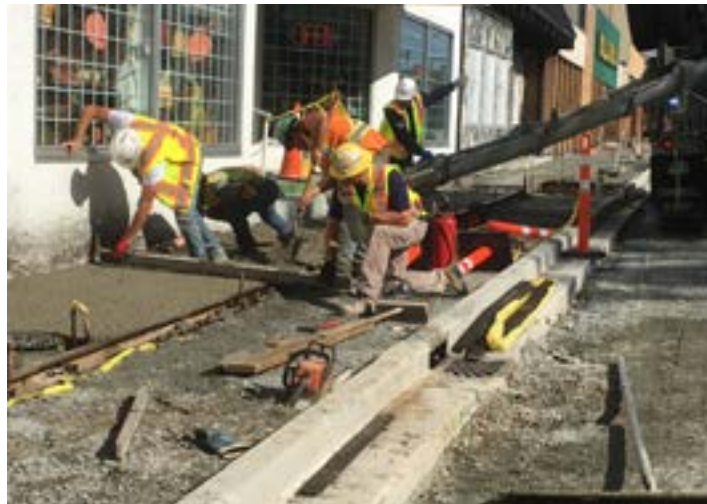
Pouring concrete sidewalk on the north side of Lougheed Highway from 225 Street to 226 Street.