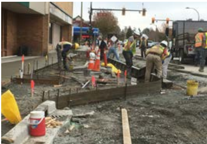
Placing forms to pour a curb bulge on the north side of Lougheed Highway between 225 and 226 Street.