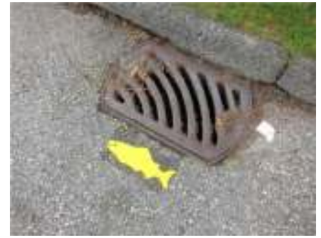
Figure 5: Catch Basin Marking