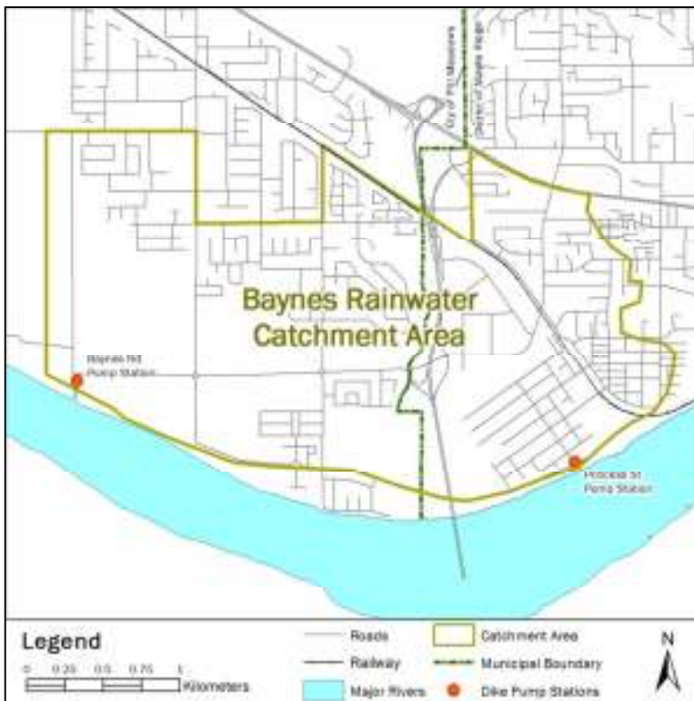
Figure 2: Baynes Pump Station Rainwater Catchment Area

Rainfall runoff is diverted west from Hammond to Pitt Meadows via the Golden Ears Bridge interchange drainage system and Katzie Slough. Once rainwater flows into Pitt Meadows from Hammond, it continues to drain west along the Airport Way ditch to the Baynes Road Pump station where it is discharged into the Fraser River. The approximate catchment area that collects rainfall runoff to the Baynes pump is displayed in Figure 2.