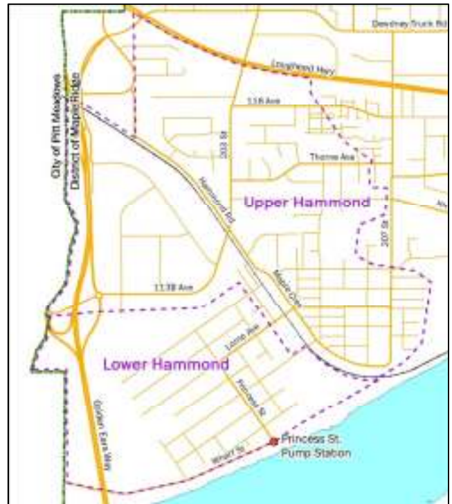
Figure 1: Simplified Drainage Areas of Hammond

Rainwater management facilities provide for the protection of property and the natural environment. The drainage system in Hammond can be grouped into two distinct regions, Upper and Lower Hammond (Figure 1). Upper Hammond stormwater runoff is conveyed primarily through the underground storm sewer system. The Lower system carries rainwater through open roadside ditches, road crossing culverts, and short segments of storm sewers. Furthermore, there is a pump station at the end of Princess Street that helps drain a southern section of the Lower Hammond neighbourhood by discharging rainwater directly into the Fraser River at the location displayed in the figure.