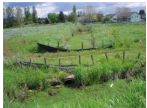
Figure 4: Ospring Street Outflow Channel

Areas in Lower Hammond drain into drainage ditches. These vegetated ditches help to prevent erosion by reducing peak flows, decrease pumping energy requirements by infiltrating water into the ground, and improve water quality by trapping sediment and other pollutants.