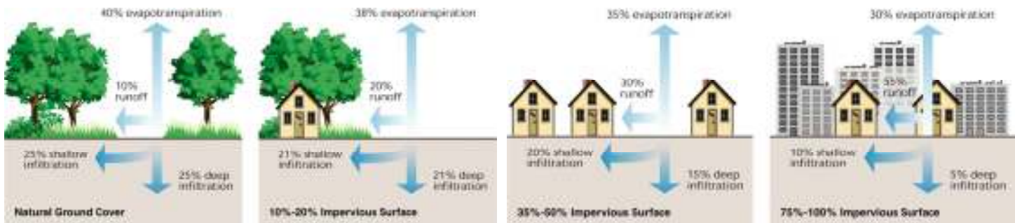
Figure 3: Generalized Runoff Rates vs. Percent Impervious Surfaces

Runoff is generated from dispersed land surfaces such as pavements, yards, driveways, and roofs. As the percentage of impervious area in a region increases, the quantity of runoff also increases.