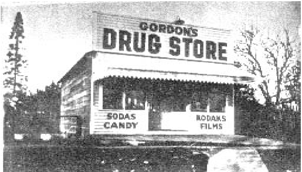
Above: Port Hammond, Maple Crescent, Circa 1924 (Provincial Archives #52494).