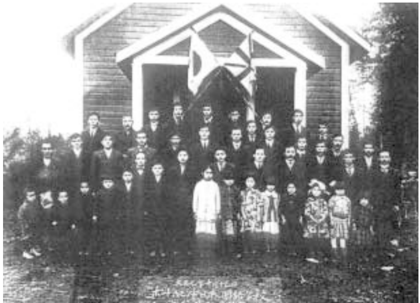
Above: "Original" Hammond Farmer's Hall "Japanese School 1918" (M.R.M. & A., p.1364)