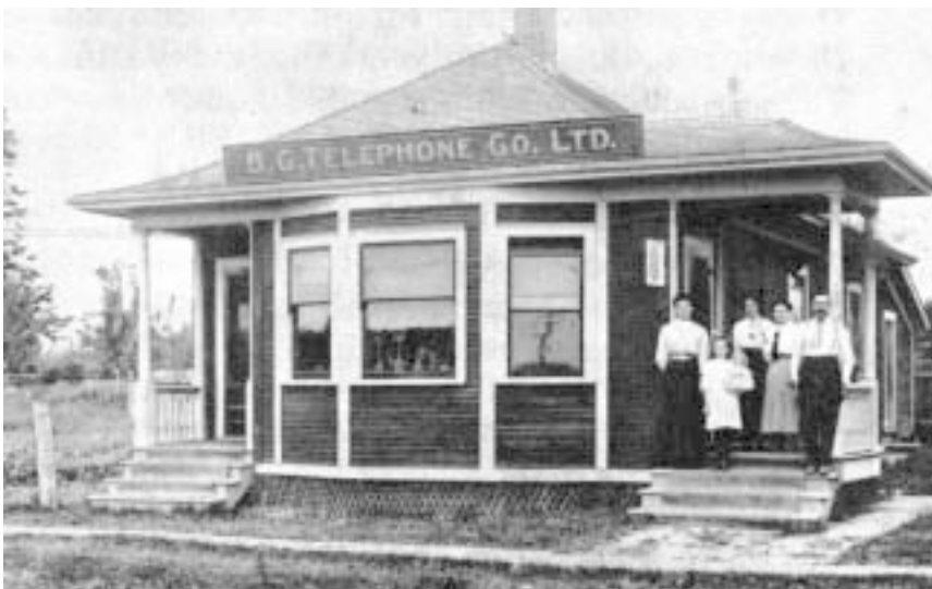
Right: Telephone Office, 1910

Like many other early B.C. Telephone Company exchanges, this was a prefabricated structure ordered from the B.C. Mills Timber & Trading Company. This patented modular system used panels assembled from short ends of milled lumber, which were delivered by rail, and bolted together on site. It has now been converted for use as a private residence; the character of the building has been somewhat altered through the enclosure of the corner porch and the application of a later coat of stucco over the original siding. It remains as a tangible link to the early development of Hammond, and an example of an early prefabrication method of construction.