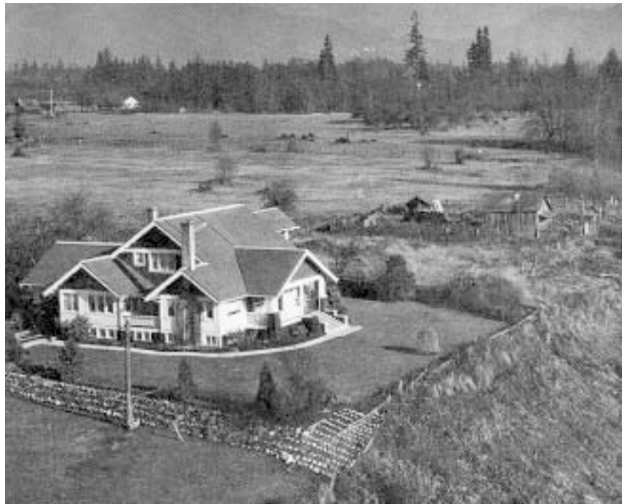
Hartnell Residence