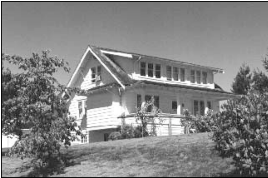
ITO RESIDENCE NOW ST. LUKE'S CATHOLIC CHURCH MANSE 20285 Dewdney Trunk Road Circa 1932