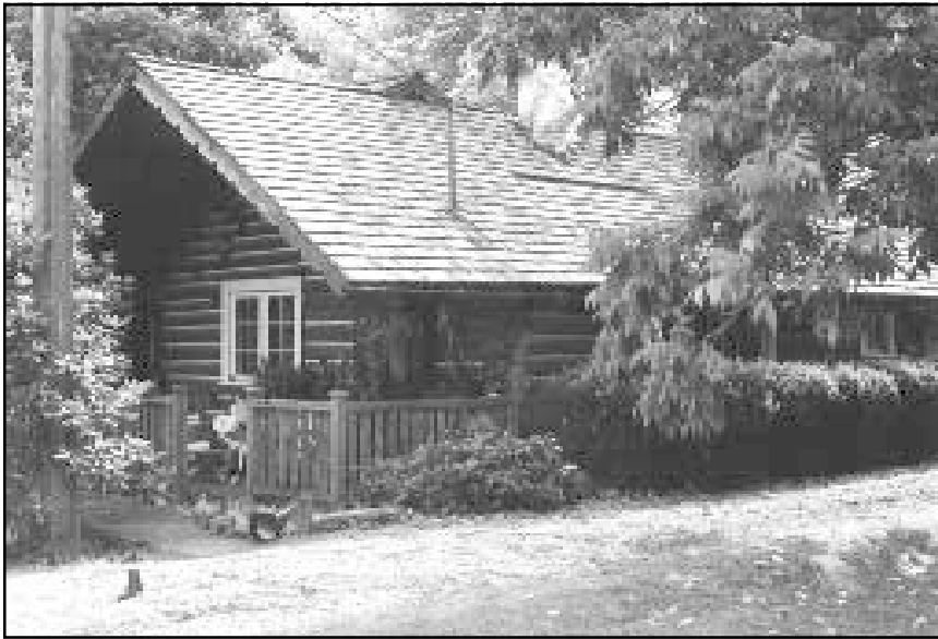
LOG RESIDENCE 12263 256 Street Circa 1930s

This log house sits on a large rural lot, with a barn at the rear. It retains its early multi-paned wooden sash windows, and the logs are connected with notched corners. The original owner and date of construction are unknown.