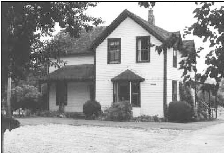
ANSELL RESIDENCE 24750 Dewdney Trunk Road Circa 1909

This log house sits on a large rural lot, with a barn at the rear. It retains its early multi-paned wooden sash windows, and the logs are connected with notched corners. The original owner and date of construction are unknown.