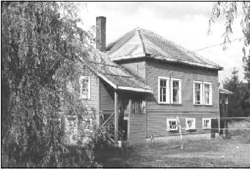
FORMER SCHOOLHOUSE 22413 136 Avenue Circa 1914