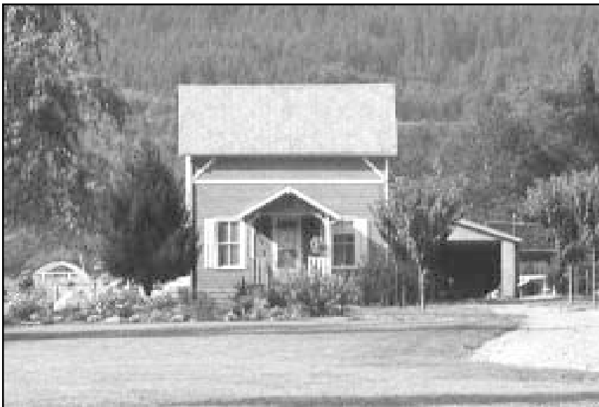
KOSKY RESIDENCE 22679 136 Avenue Circa 1890 or Later