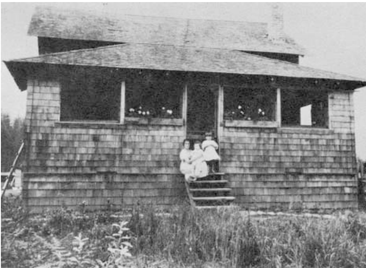
Above: Marc home, circa 1925.