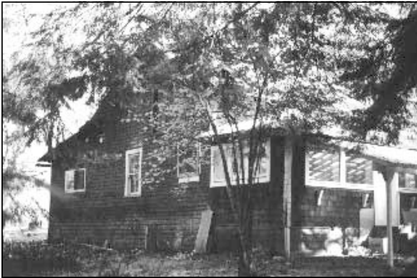
MARC RESIDENCE Marc Road (Street Address) R.R. #2 (Legal Address) Circa 1910