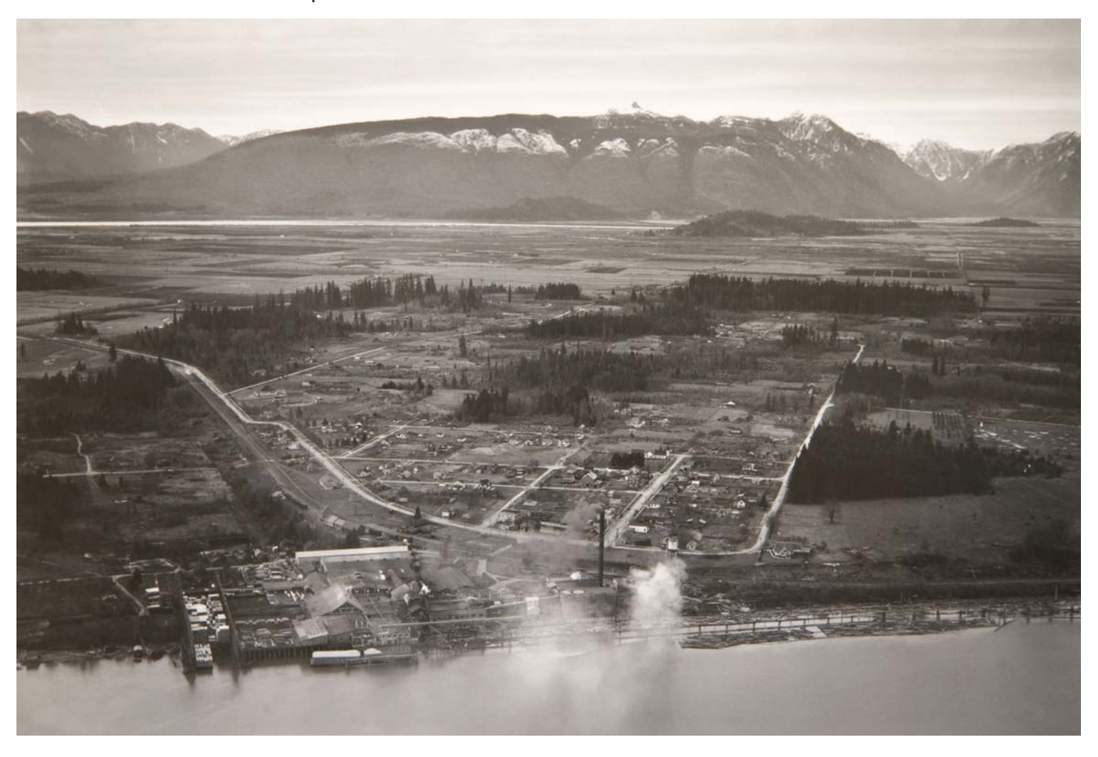
THANK YOU FOR YOUR PARTICIPATION!

Visit the #MRHeritage - Inventory Project webpage for more information. You can also nominate a site online using the #MRHeritage Nomination Form, nominations will be accepted until Monday, October 31, 2016 at 4:00pm.