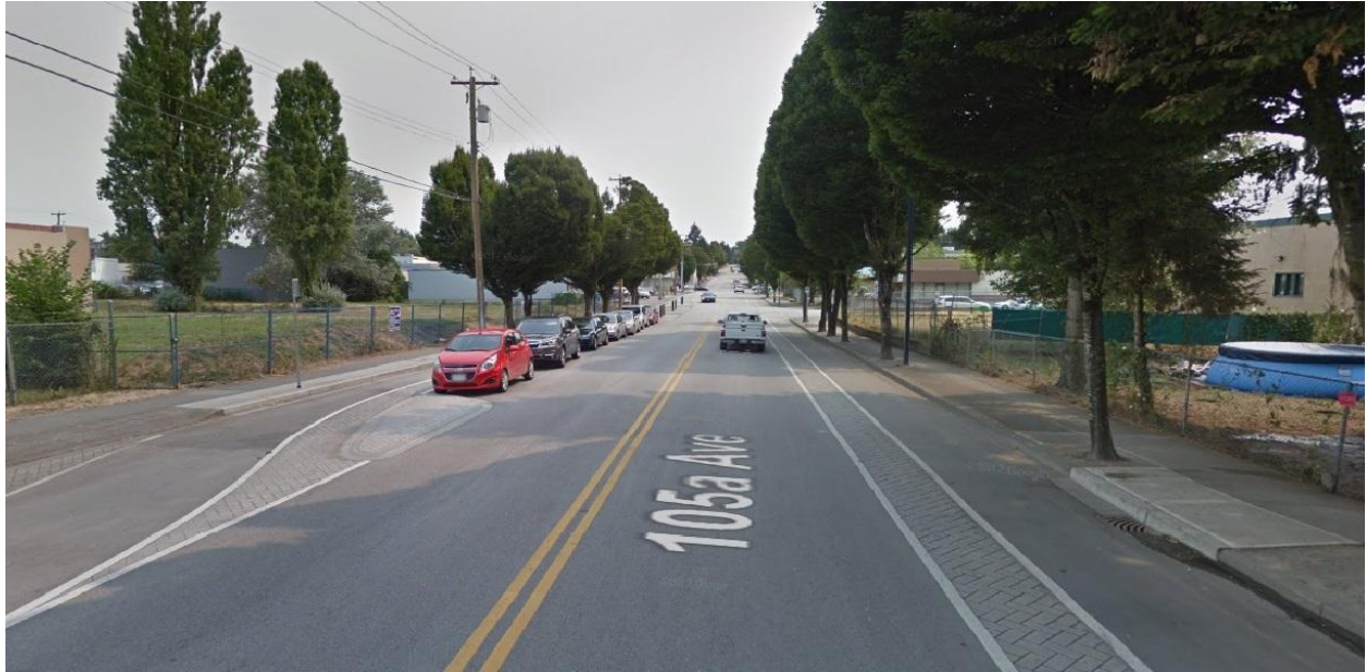
Figure 1 - 105a Ave, Surrey