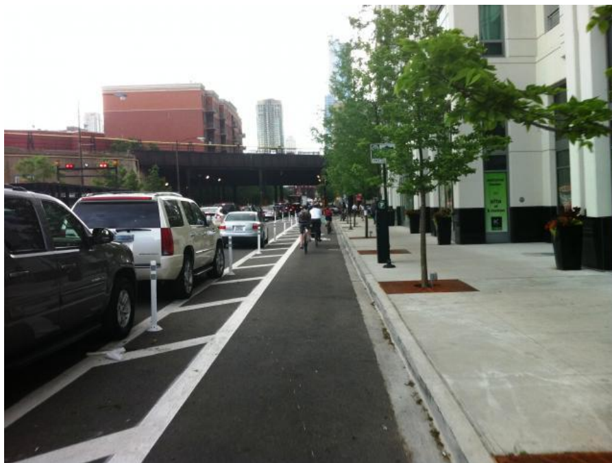
Figure 2 - Example cheap parking protected bike lane with delineator posts