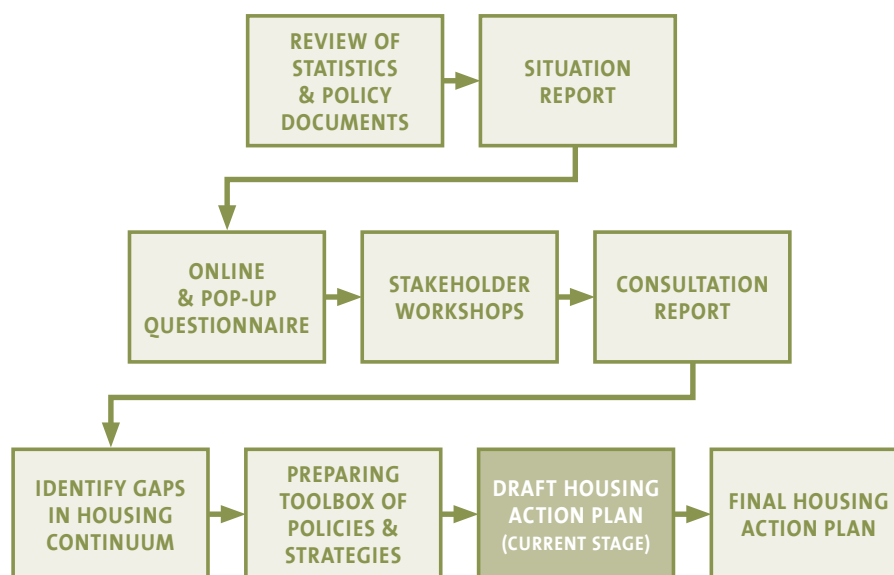
FIGURE 1.1: Housing Action Plan Project Outline

Figure 1.1 outlines the different phases of work in the Housing Action Plan and what stage the project is at now.