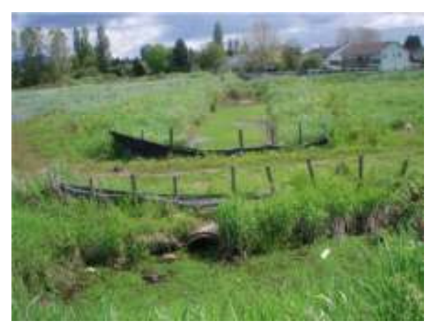
Figure 4: Ospring Street Outflow Channel

Areas in Lower Hammond drain into drainage ditches. These vegetated ditches help to prevent erosion by reducing peak flows, decrease pumping energy requirements by infiltrating water into the ground, and improve water quality by trapping sediment and other pollutants.