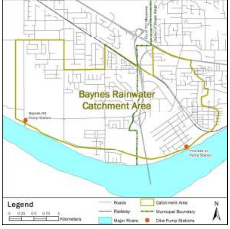
Figure 2: Baynes Pump Station Rainwater Catchment Area

Rainwater management facilities provide for the protection of property and the natural environment. The drainage system in Hammond can be grouped into two distinct regions, Upper and Lower Hammond (Figure 1). Upper Hammond stormwater runoff is conveyed primarily through the underground storm sewer system. The Lower system carries rainwater through open roadside ditches, road crossing culverts, and short segments of storm sewers. Furthermore, there is a pump station at the end of Princess Street that helps drain a southern section of the Lower Hammond neighbourhood by discharging rainwater directly into the Fraser River at the location displayed in the figure.