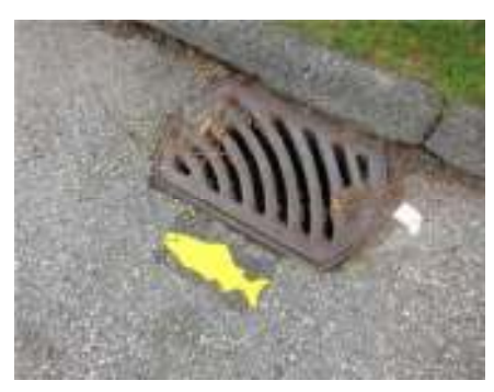
Figure 5: Catch Basin Marking

The District of Maple Ridge is developing Integrated Stormwater Management Plans (ISMPs) as required in each the District's watersheds. The District's ISMPs will "link the health of urban streams to land use decisions and will seek to protect the health of urban streams by better managing rainwater where it falls".