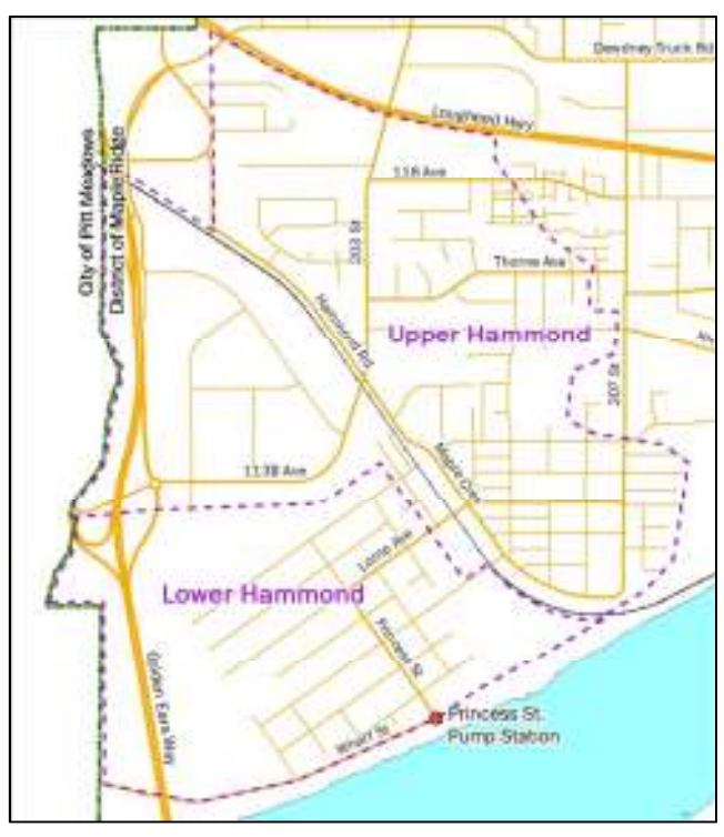
Figure 1: Simplified Drainage Areas of Hammond

Rainfall runoff is diverted west from Hammond to Pitt Meadows via the Golden Ears Bridge interchange drainage system and Katzie Slough. Once rainwater flows into Pitt Meadows from Hammond, it continues to drain west along the Airport Way ditch to the Baynes Road Pump station where it is discharged into the Fraser River. The approximate catchment area that collects rainfall runoff to the Baynes pump is displayed in Figure 2.